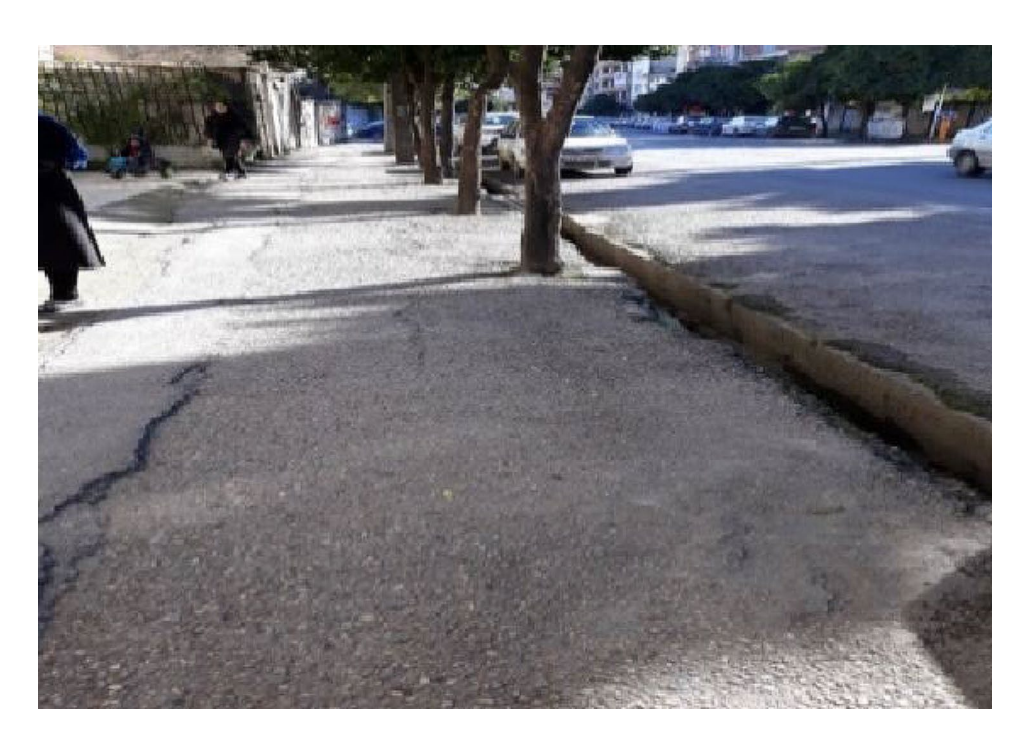
Fig. 4 A sample of sidewalks with unsafe flooring. (From: Ghaffari Gilandeh A, Mohammadi C, Davari E. Evaluating elderly-friendly city indicators (A case study of Sari). Environ Based Territorial Planning. 2022;15(56):1–25.)

Fallahi et al. BMC Geriatrics (2024) 24:412 Page 5 of 15