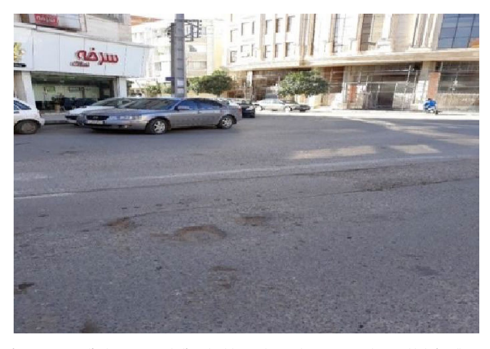
Fig. 3 A sample of inappropriate traffic design. (From: Ghaffari Gilandeh A, Mohammadi C, Davari E. Evaluating elderly-friendly city indicators (A case study of Sari). Environ Based Territorial Planning. 2022;15(56):1–25.)