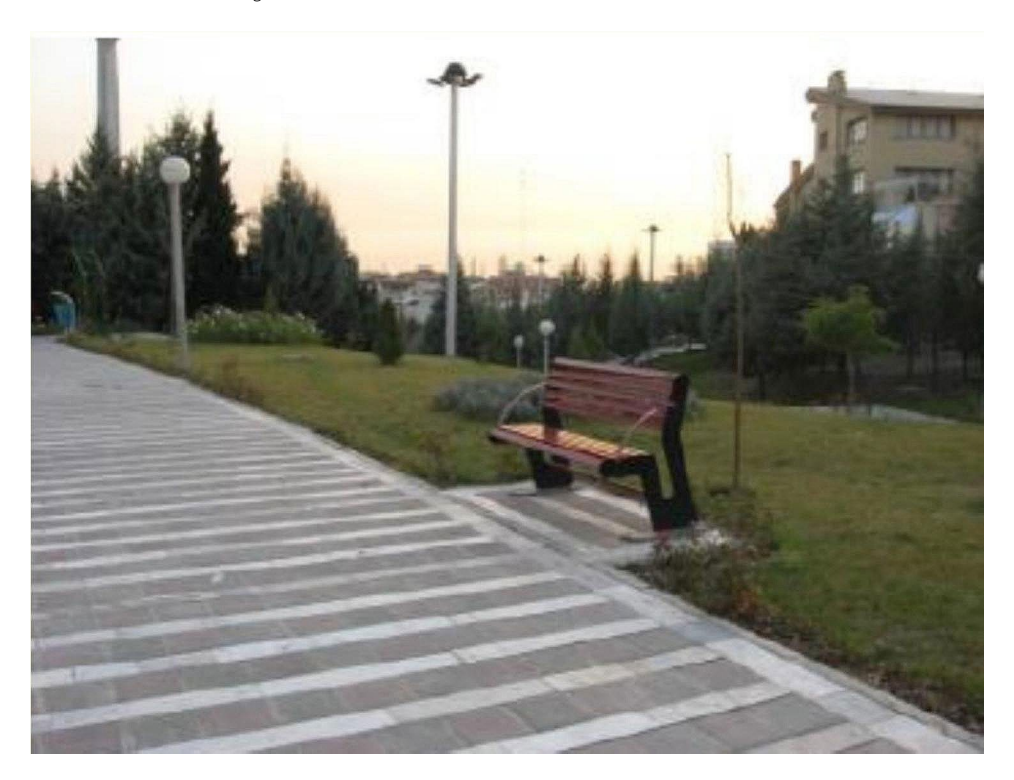
Fig. 5 A sample of lack of non-standard furniture and equipment for older adults. (From: Sharqi A, Zarghami E, Olfat M, Salehi Kousalari F. Evaluating status of global indices of age-friendly city in Tehran metropolis (AFC). J Urban - Regional Studies and Research. 2016;8(28):1–22.)

as data analysis, were conducted manually. Two researchers carried out all these steps. Any conflicts among the reviewers were resolved through discussion and consulting a senior team member.