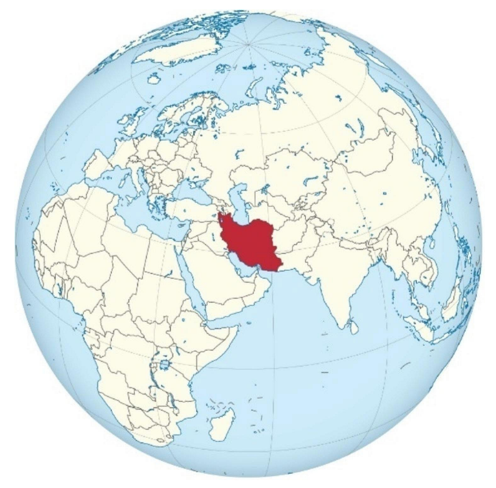
Fig. 1 Iran's location on the globe.

In the past two decades, the simultaneous phenomena of population aging and urbanization have brought attention to the concept of an "age-friendly city." An agefriendly city is a city where older people have equal rights as citizens of other age groups. In such a city, urban standards and designs are respected in a way that creates suitable opportunities for the participation and security of older adults. These cities are designed for older adults with various capacities [8]. This concept emphasizes active aging to enhance health and security among older adults, ultimately improving their quality of life. It is crucial to identify the capabilities and needs of older adults, providing them with the opportunity for effective participation and increased social presence [9]. An age-friendly city characterized by urban facilities and infrastructures that enable active aging, allowing older adults, regardless of their abilities, to actively participate in society. In contrast, inadequate urban spaces and a lack of support